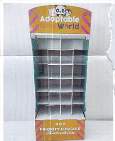
9. Assembled stand.