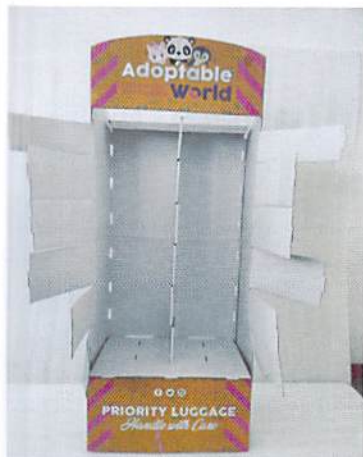
5. Insert vertical centre support.