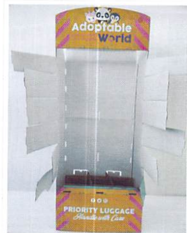
3. Assemble brown card base supports, place inside the main section.