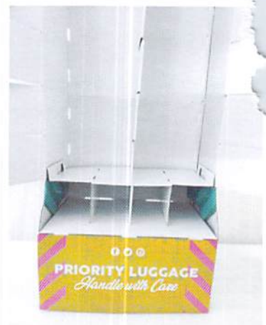
6. Insert the bottom shelf, fold to match image above.