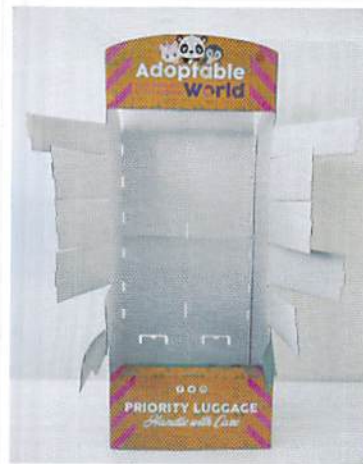
2. Erect the main section to match the image above.