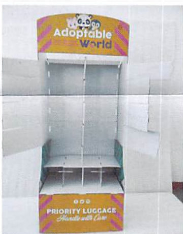
7. Fold main section tabs, to lock the shelf into place. Match to image above, repeat process with all shelves.