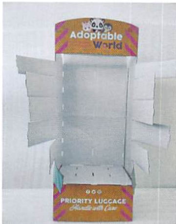
4. Cover the base supports with base panel, lock into place with tabs provided.